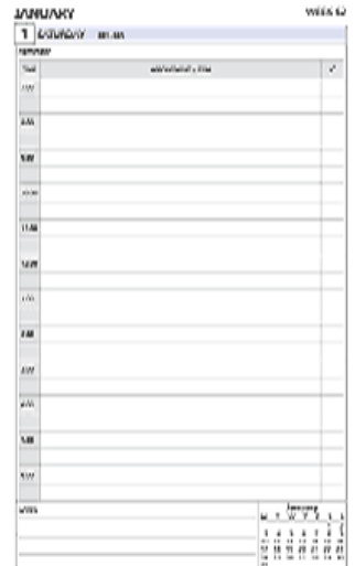
Day to Page format

Order now for delivery starting November 2009!